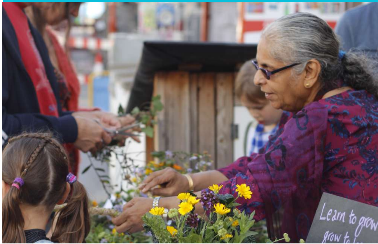
A volunteer at an Apple Day event, Fast London © Laura Martine:

We've gathered together further resources to help you in your efforts to promote wellbeing through volunteering. Look at our volunteering page for more information.