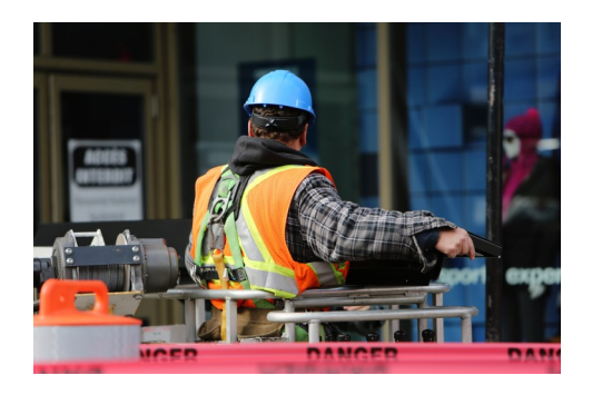
I need to enjoy my job. Doing something that I love even if the reward is not as great financially. -Cardiff

In my work I have long shifts and it's a really hard and stressful job. Even having a wee debrief with everybody, a catch up is really good. Not everyone gets on all the time, that's never going to happen, but if you're a smaller group that is quite strong it's a thing that needs to be done. -Falkirk